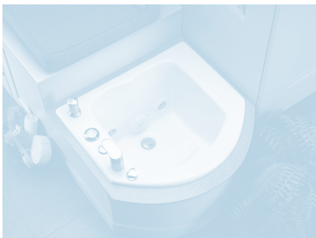
U.S. Patent # 468,816