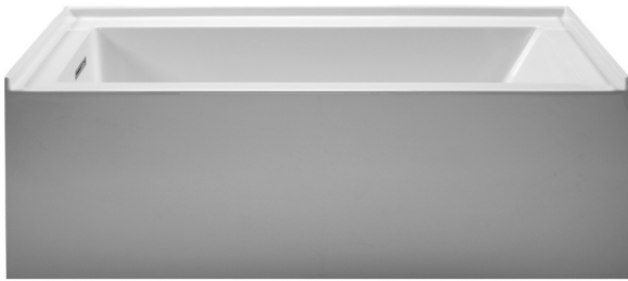
Features integral skirting and tile flange.