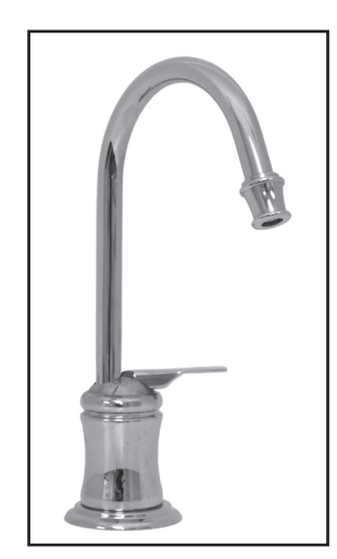
TRADITIONAL COLD ONLY